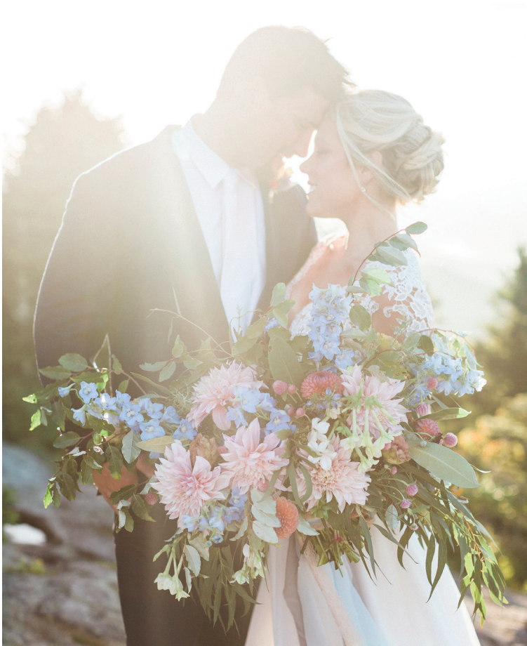
COMMON DOVE PHOTOGRAPHY

The print publication and blog work hand in hand with a growing social media presence to share beautiful imagery and content throughout the year!